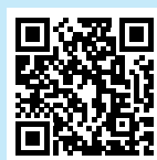
CityU Scholarships for Hong Kong Talents